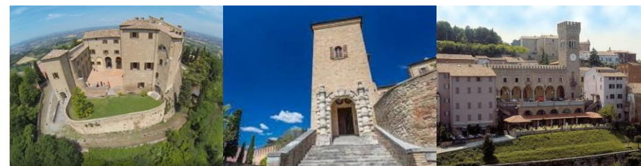
Bertinoro - Location of EUPOC2025